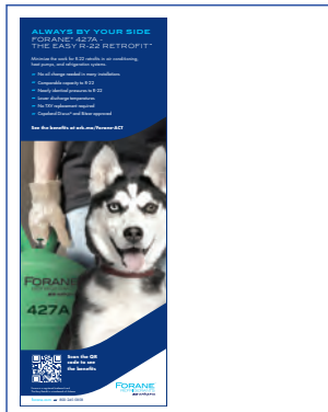
HALF PAGE VERTICAL 5.1" x 14"