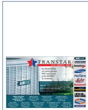
HALF PAGE HORIZONTAL 10.375" x 7"