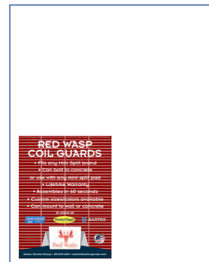
QUARTER PAGE 5.1" x 7"