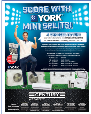
FULL PAGE 10.375" x 14"